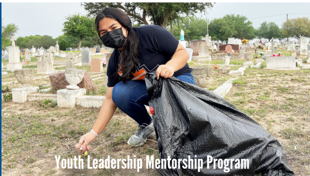
Youth Leadership Mentorship Program

UNITED WAY IMPROVES LIVES BY MOBILIZING THE CARING POWER OF OUR COMMUNITY TO ADVANCE THE COMMON GOOD.