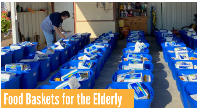
Food Baskets for the Elderly

United Way funds various programs in Starr County that provide basic necessities for the elderly and disabled; medical assistance to impoverished families, food pantries and much more. Parents receive books for their newborns to introduce them to and encourage reading in the home.