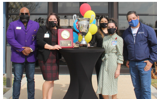
#1 COMPANY & 2020 SOUTH TEXAS HERO H-E-B Border Region

Employees at NavyArmy Community Credit Union branches increased their donations by 104% during the pandemic.