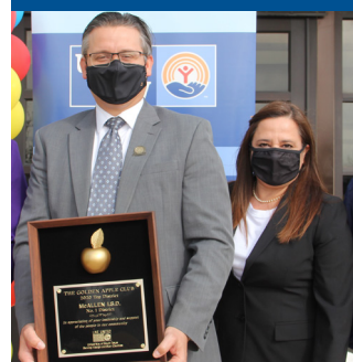
#1 GOLDEN APPLE DISTRICT McAllen I.S.D.