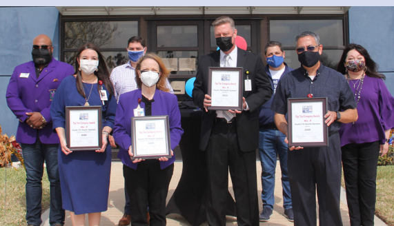
"TOP 10" COMPANY South Texas Health System