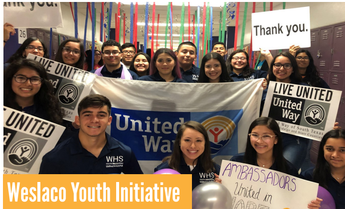
Weslaco Youth Initiative

United Way funds food pantries in four school districts to maintain food security for students and families. School Districts are given the flexibility to purchase various items from their local food bank. Our goal is for students to receive their daily nutritional needs to reach the highest level of educational attainment and job opportunities.