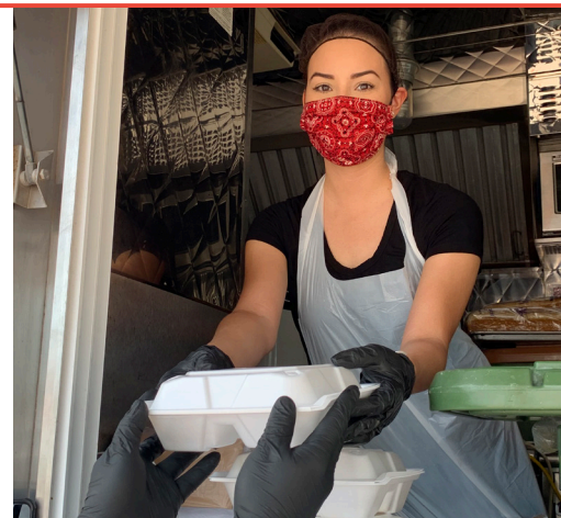
Hot Meals Distributed Daily

AEP Texas, BBVA Foundation, Fidelity Foundation, H-E-B, ONE Gas Foundation, Security Service Federal Credit Union, Truist Foundation, United Way of South Texas, United Way Worldwide, Wells Fargo Foundation and private donors contributed to the Fund.