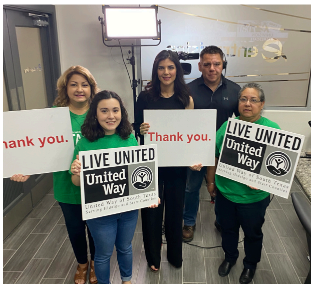
VITA Volunteers Participate in a Phone Bank at Entravision to Offer Tax Information

The VITA program is an IRS initiative administered by United Way of South Texas in Hidalgo and Starr Counties. The program is designed to help families, who earned $60,000 or less in 2020, prepare their income tax returns at no cost. Last year, the VITA program, with the help of over 248 volunteers, assisted 3,967 families. VITA volunteers helped to generate $7.5 million in federal refunds!