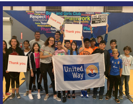
Students at Boys and Girls Clubs

United Way invests in programs administered by the agencies listed above. The Board of Directors determines the recipients annually.