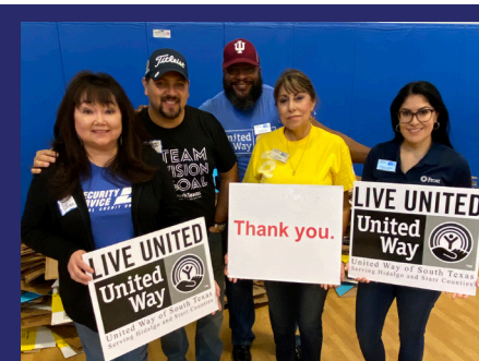
Board Members at Day of Caring