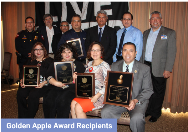
Golden Apple Award Recipients