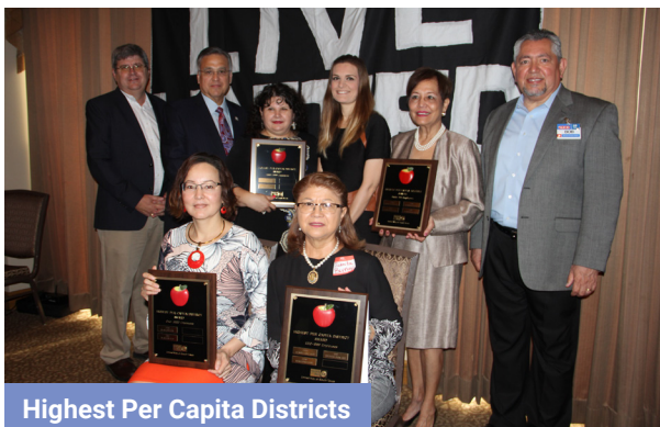
Highest Per Capita Districts