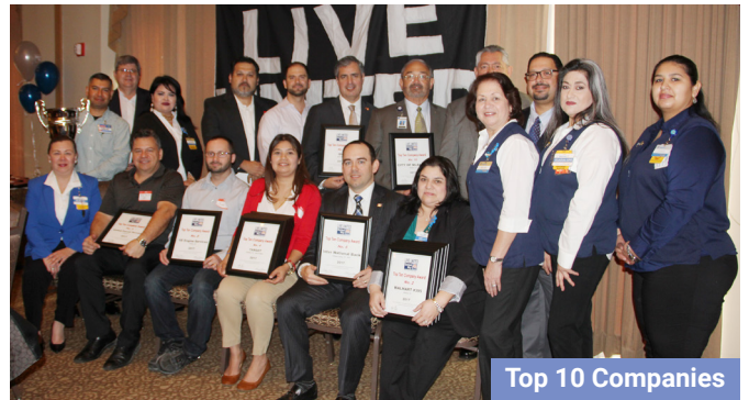
Top 10 Companies