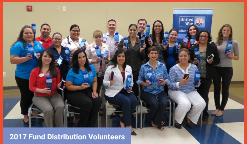
2017 Fund Distribution Volunteers

Advertis, Inc. AEP Texas BBVA Compass Bank Burton McCumber & Longoria, LLP Chase Bank City of McAllen City Of Weslaco Elsa State Bank Frost Bank H-E-B Infinity Auto Insurance Inter National Bank JP Morgan Chase Bank Lone Star National Bank Mission CISD Navy Army Community Credit Union Sam's Club Security First Credit Union Target Texas Regional Bank The Monitor Universal Pawn UT-RGV Veteran's Administration Walmart Wells Fargo