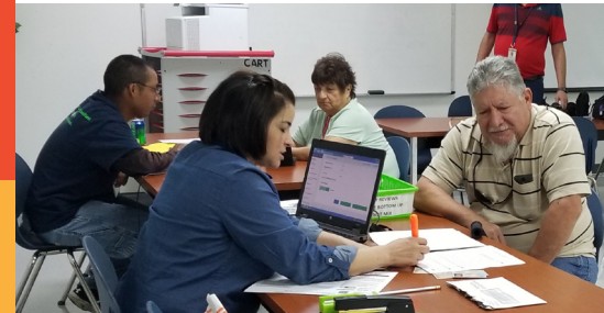
Volunteer Income Tax Assistance (VITA) Program Volunteers & Clients