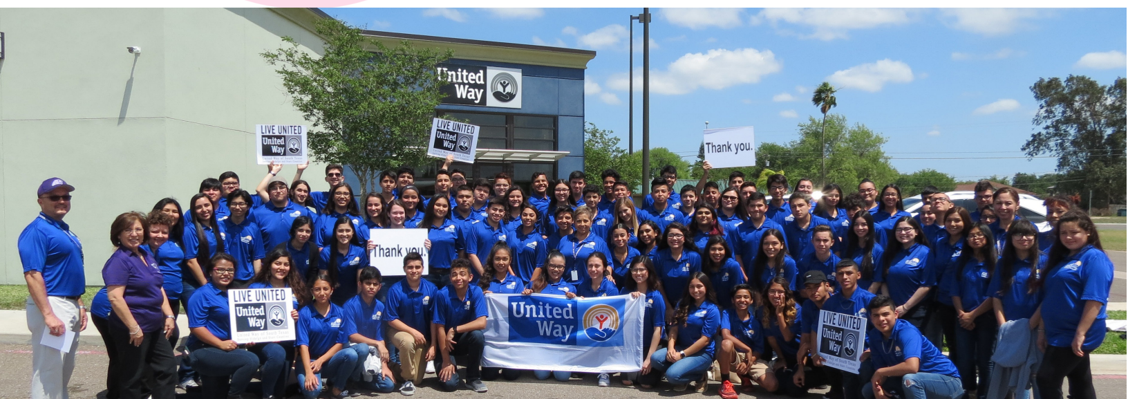
United Way of South Texas partnered with Weslaco I.S.D. in 2017 to empower 100 Juniors and Freshmen with the skills necessary to become successful in college and in a career.

Call United Way of South Texas at 956.686.6331 if you have any questions.