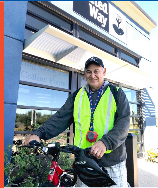
Transportation Voucher Client and Veteran

Individuals with disabilities or other barriers to employment received employment services.