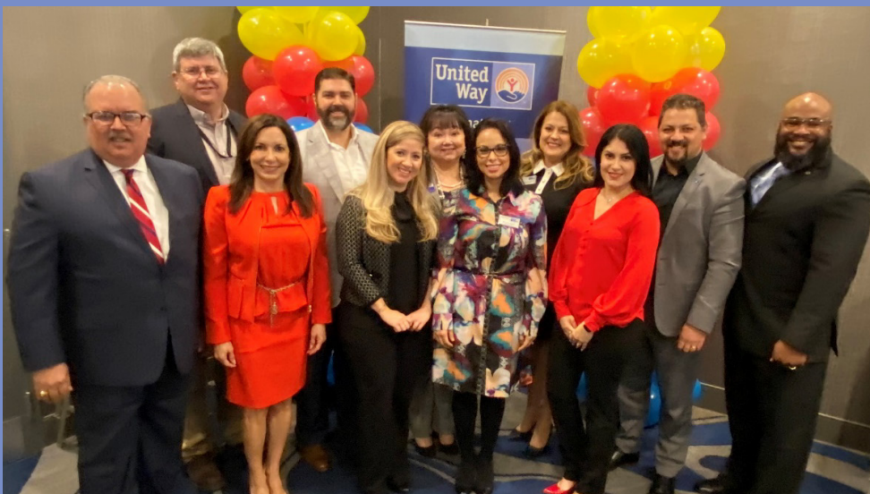
United Way Board of Directors at the 2020 Awards Ceremony