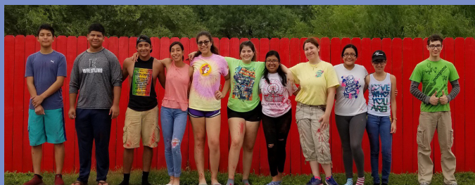
Weslaco I.S.D. Students at a Service Project

Baby Boxes are self-contained sleep spaces that have been shown to increase infant safety by reducing the risk of Sudden Infant Death Syndrome (SIDS). Parents take a 15-minute course on safe sleeping practices and can pick up their baby box at no cost after scoring 100%.