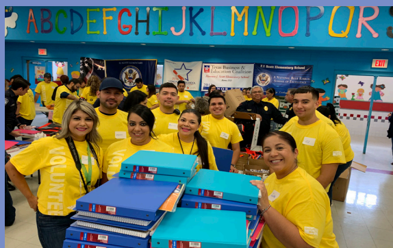
Starr County Day of Caring Event