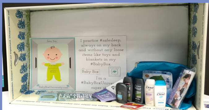
Baby Box with Bag of Essentials