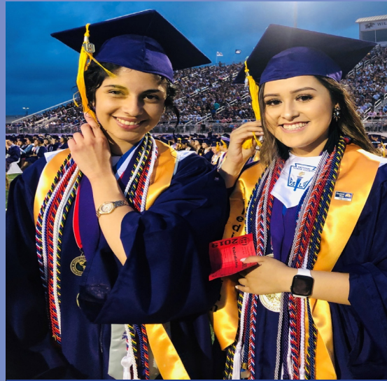
Weslaco I.S.D. Youth Initiative Graduates

The United Way Youth Leadership Program empowers Juniors and Freshmen with leadership skills, soft skills, volunteer opportunities and financial literacy. School counselors identify Freshman to participate as mentees and Juniors volunteer as mentors. In the past two years, 176 students have benefited from the program.