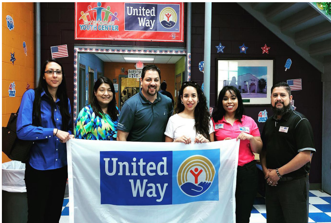
Fund Distribution Volunteers at Hidalgo Youth Center

Fund Distribution volunteers thoroughly review applications, financial audits and make on-site visits-all with one goal in mind: to ensure that our supporters are making the best "choice" when they give to United Way. We treat every donor dollar as our own!