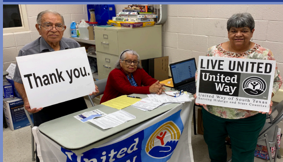
VITA Volunteer and Clients