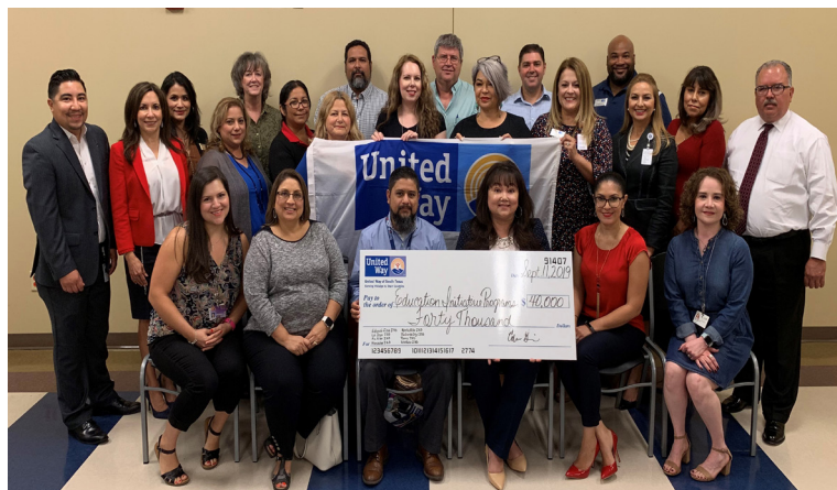
Education Council with United Way Board of Directors

Community Impact Grant – A special grant awarded to Comfort House for their end-of-life care services in McAllen Texas.