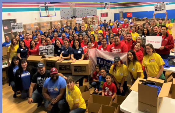
Hidalgo County Day of Caring Event